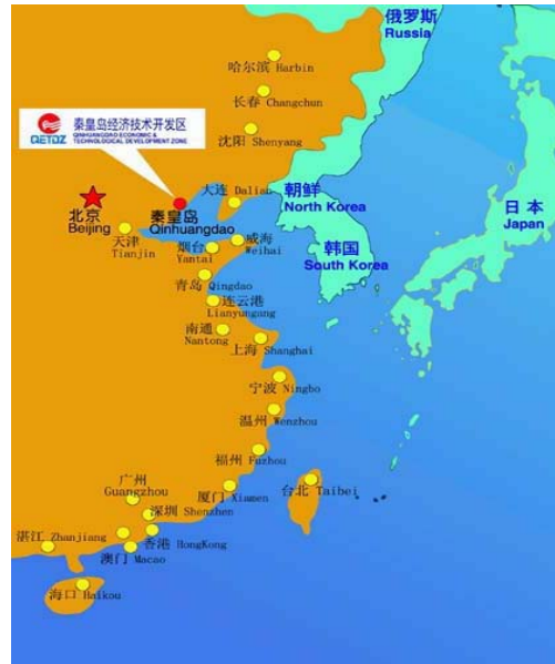
Figure 2. Location of Qinhuangdao.