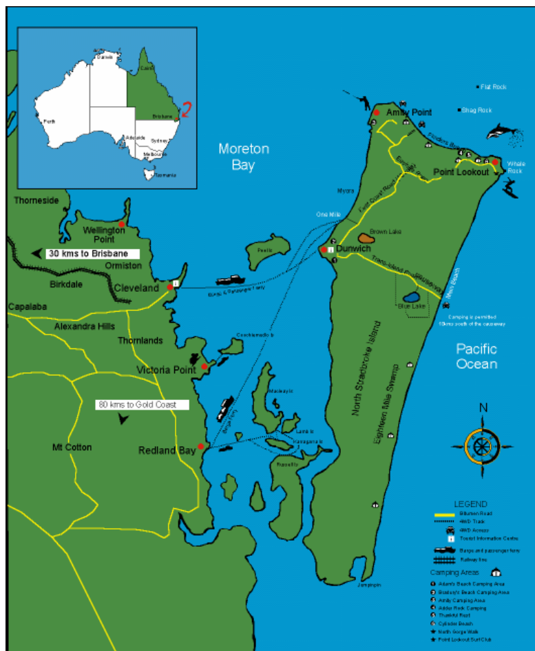
Figure 1: Redland Shire, location and major transport links

The Shire is recognised as the Koala Capital of Australia due to the number of koalas within the urbanised environment. There is no where else in the world where so many people consistently interact with a natural population of koalas.